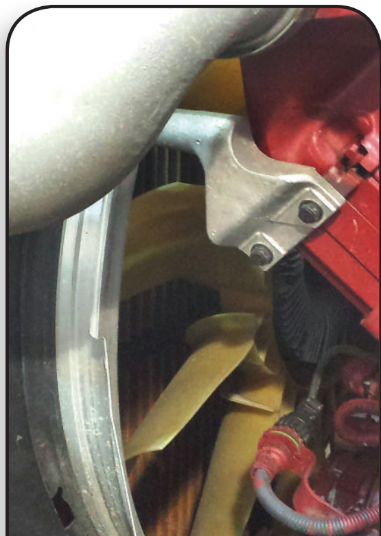
Side view shows MESABI™ V-Core.